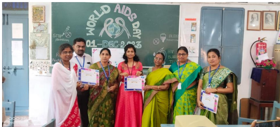
Presentation of certificates to skit performers