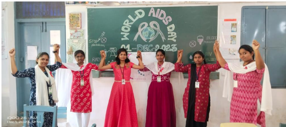
Students giving message for AIDS free Society