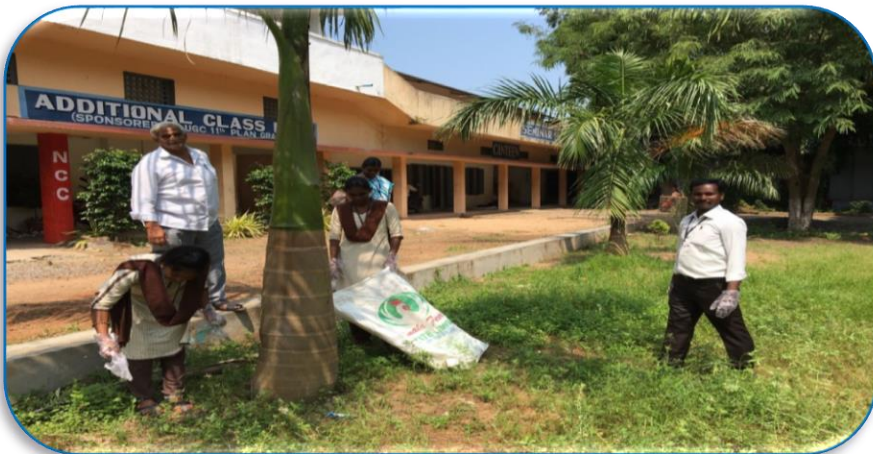
Our college students collected the plastic covers and plastic bottles in college campus