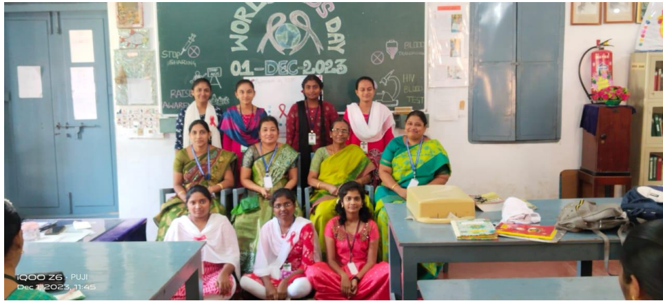
Skit performers with Zoology and Botany Staff