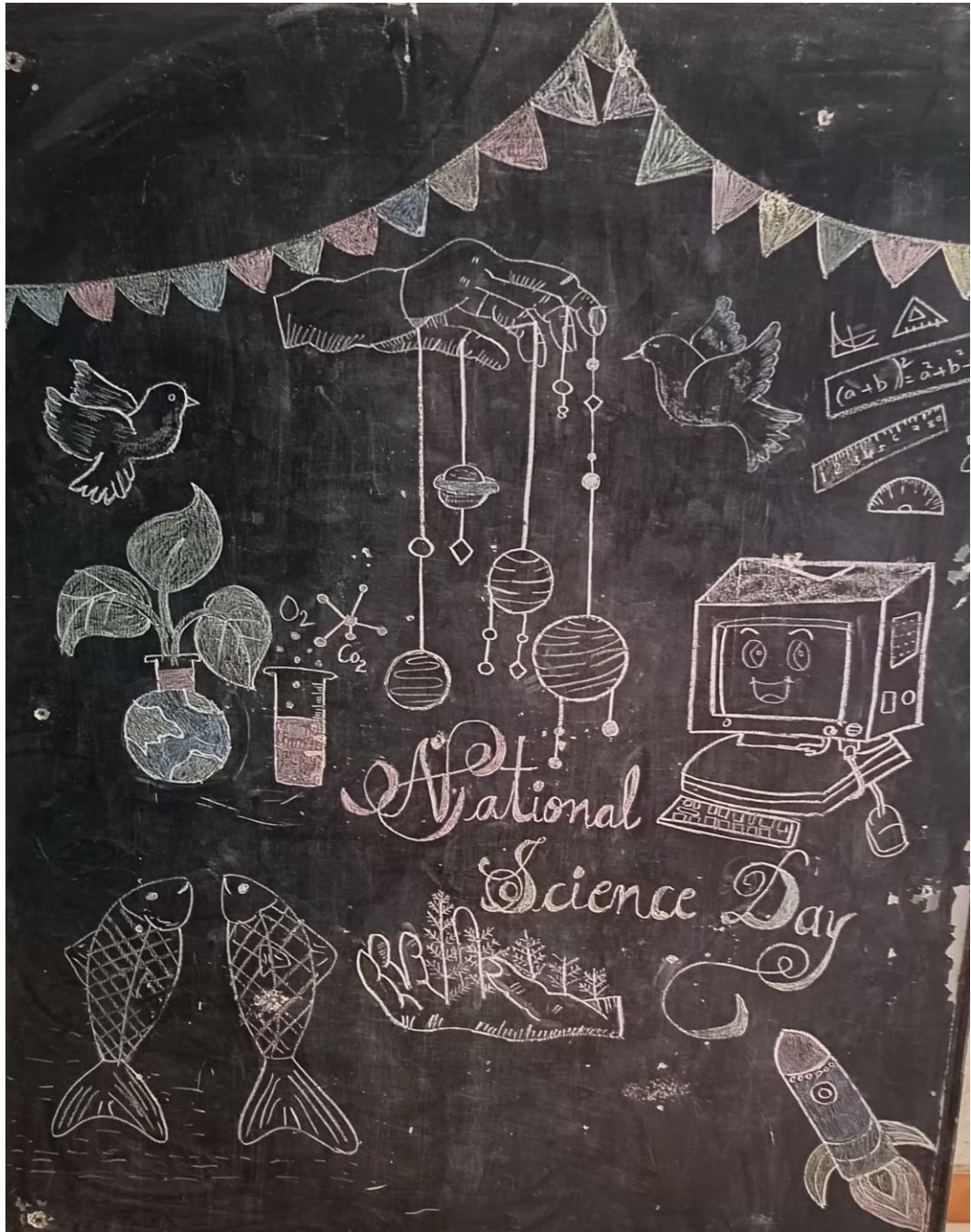
National Science Day depicted on black board by Kartileya II BZC Student