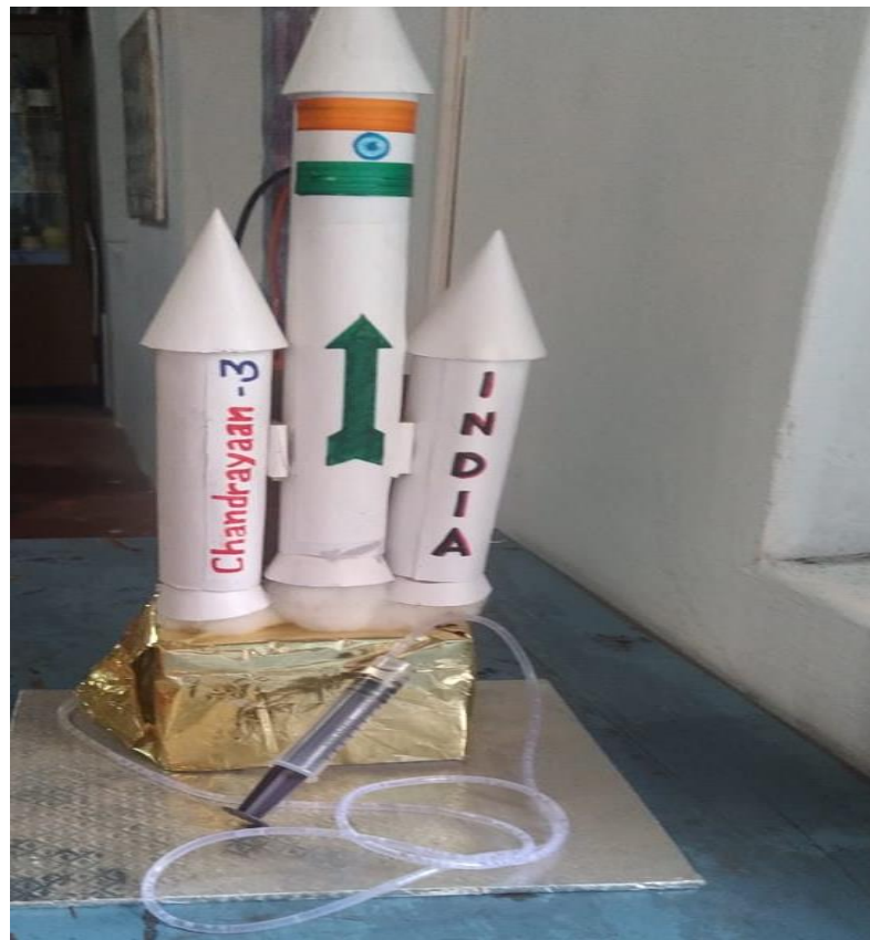
Chandrayan III Model exhibited on National Science Day