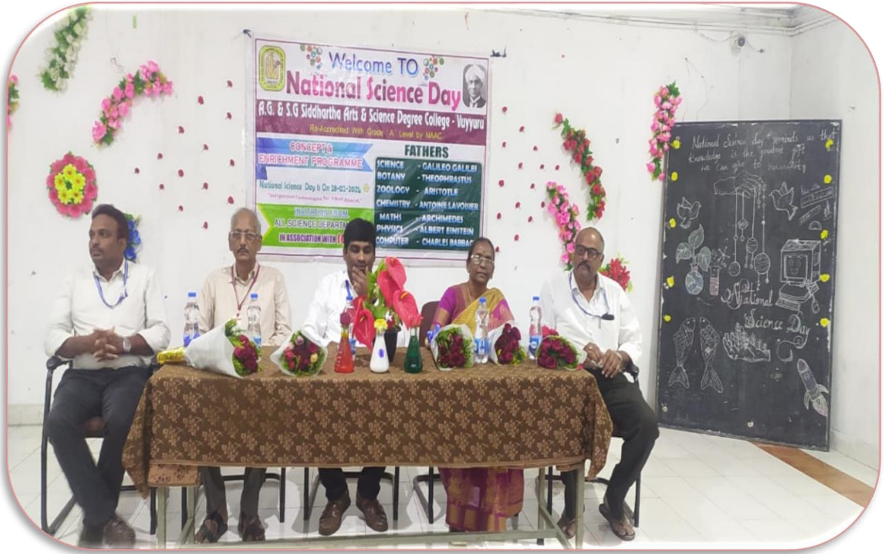
Principal, Special Officer and staff with Ph.D's on the dias