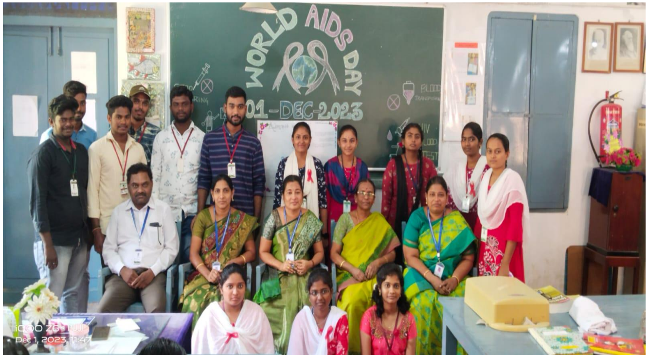
Zoology & Botany Staff with III BZC Students Who Performed Skit on AIDS