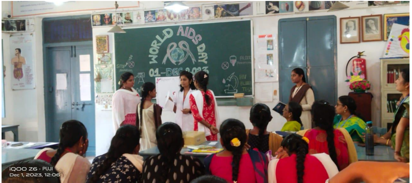
III BZC Students performing skit on AIDS