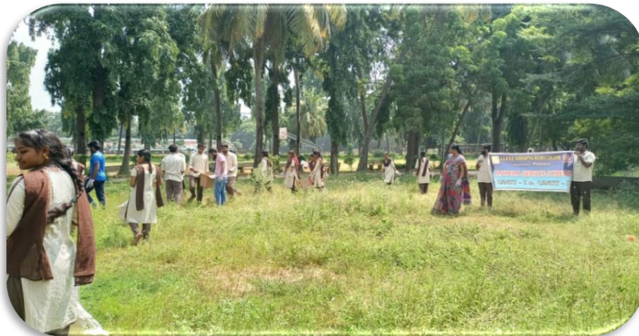
Our college students collecting the plastic covers and plastic bottles in open place