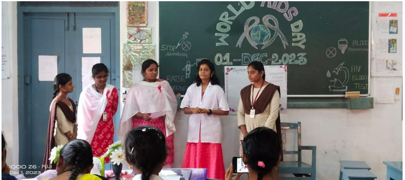
III BZC Students performing skit on AIDS