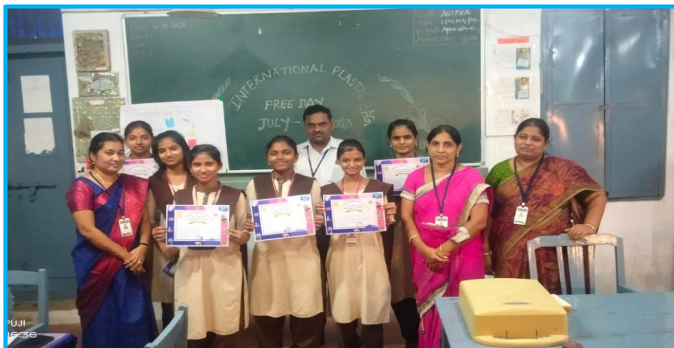
Certificate presentation to prize winners