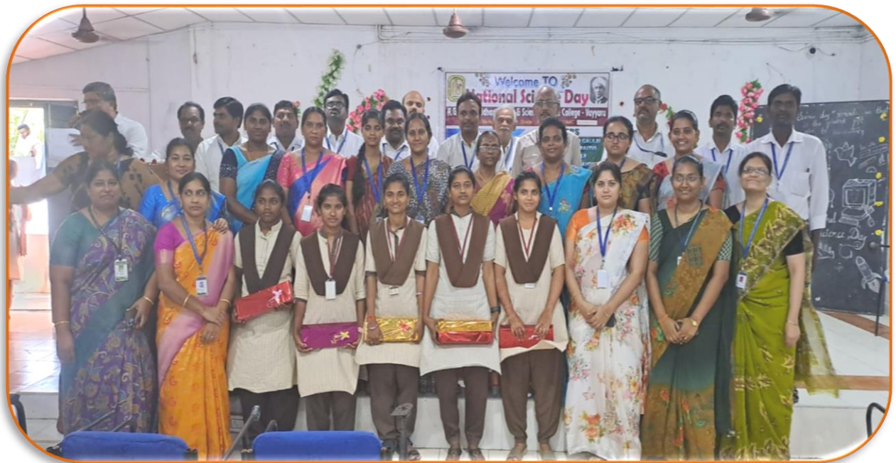
Staff and Prize winning students on National Science Day